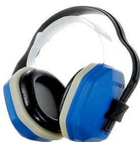
Fig. 7. Headphones for noise reduction at production workplaces.