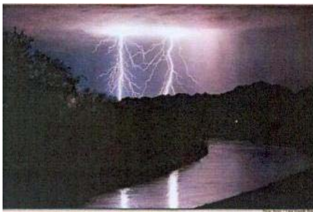
Fig. 2. The sound of thunder (lightning)