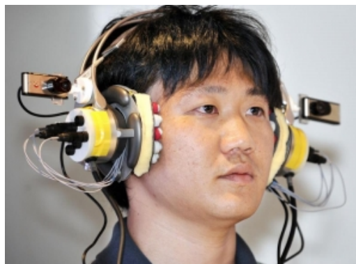
Fig. 6. Headphones used by musicians

Those means of individual protection are manufactured with the use of the most sophisticated technologies, and the efficiency of noise reduction is studied.