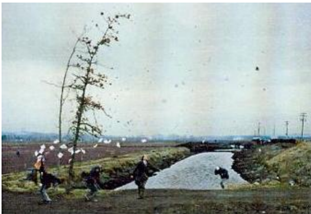
Fig. 1. The sound source – wind

If we start raising the problem from the closest, surrounding us infrasound sources, primarily, we will mention the sources which surround us in the living environment (nature). When a storm strikes, we hear the howling of wind, the rustling of tree leaves and sea waves (see Fig. 1, 2, 3 and 4). However, those sources contain also inaudible sounds (infrasound), which, together with the audible sound, propagate in the surrounding environment and fauna. Those sounds have a different effect comparing to audible sounds.