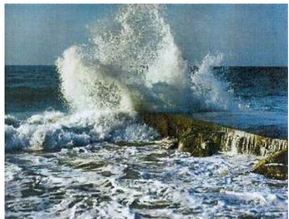
Fig.4. The rustling of sea waves