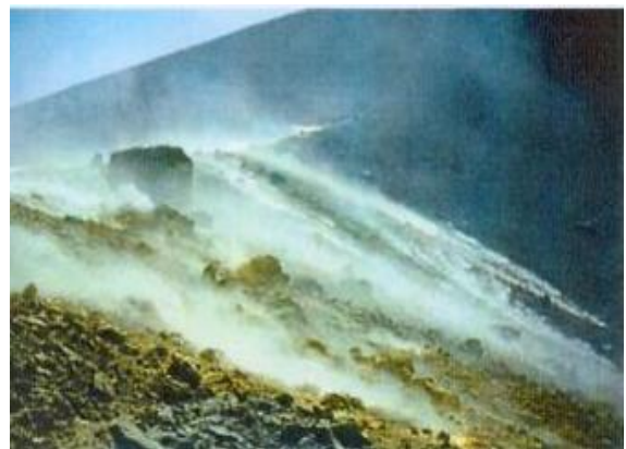
Fig. 3. The sound of earthquakes