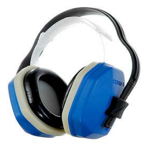
Fig. 7. Headphones for noise reduction at production workplaces.