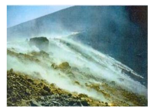
Fig. 3. The sound of earthquakes