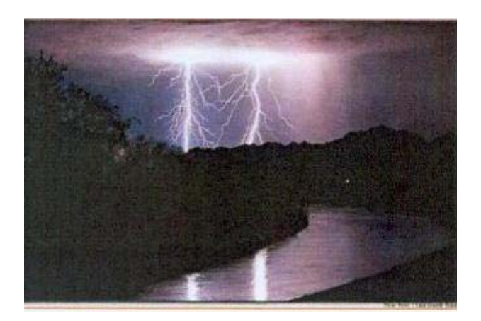
Fig. 2. The sound of thunder (lightning)