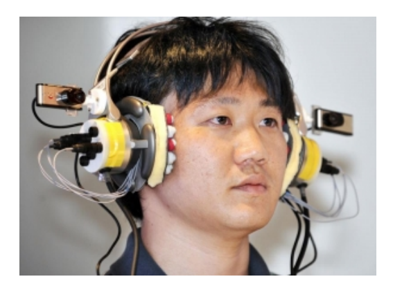
Fig. 6. Headphones used by musicians

Those means of individual protection are manufactured with the use of the most sophisticated technologies, and the efficiency of noise reduction is studied.