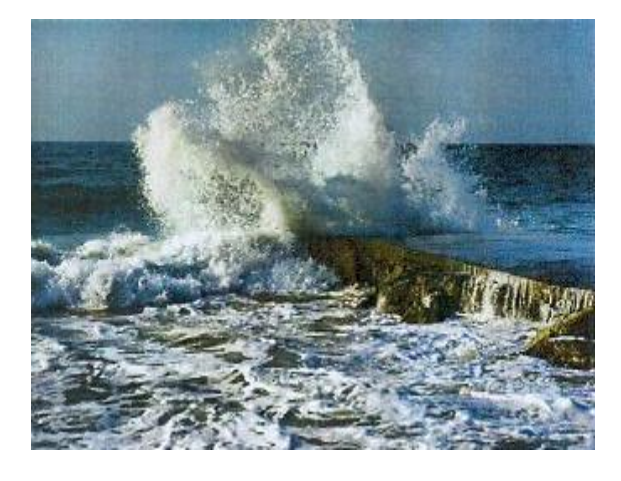
Fig.4. The rustling of sea waves