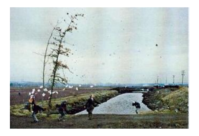
Fig. 1. The sound source - wind