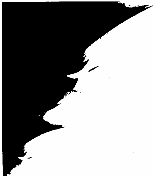
Fig. 2. Stability zones at k = 0,01

It is clear that presence of k modifies the structure of the solution. The stability zones at different values of k are presented in Fig. 2 – 5. All other parameters are analogous to Fig.1.