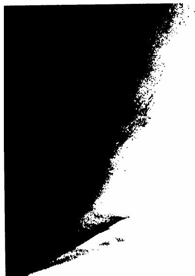
Fig. 4. Stability zones at k = 1