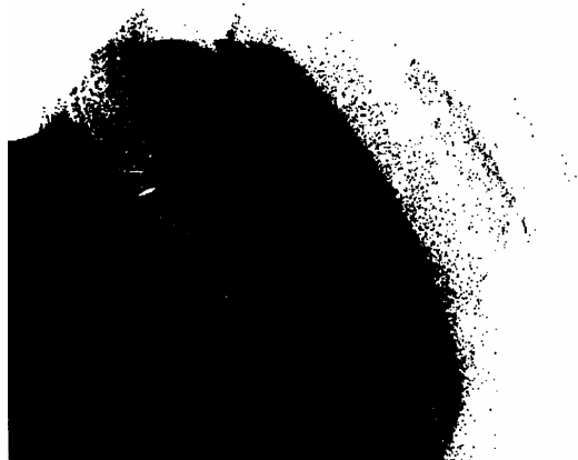
Fig. 6. Classification of solutions at k = 1, \alpha = 0 . Other parameters are analogue to those of Fig. 1– 5

case, and unstable – as b) and c) variants, the parametric plane would look like presented in Fig.6.