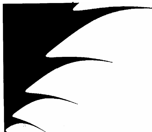
Fig. 1. The stability zones of Mathieu equation with dissipation at h = 0,1 . Black colour represents the stable zone, white – unstable. Horizontal axis denotes q , vertical a . The range q \in [0,30] , range of a \in [0,30]

where h is the coefficient of linear viscous friction are numerically found and presented in Fig. 1. Due to presence of energy dissipation, the function pairs (2.3) do not touch the axis q = 0 .