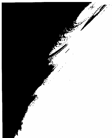
Fig. 3. Stability zones at k = 0,1

Important phenomena of Eq. 2.5 is that presence of even a small k dramatically changes the boundary line between the stable and unstable regions. Moreover, this line acquires fractal properties. Nevertheless, the global stability criterion is still valid for values of q sufficient larger than a – solution then turns unstable similarly as for Eq. 2.4.